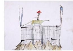
Title: Untitled (Pets and their Owners Series) Date: 1984 Primary Maker: Gregory Vose Medium: pen and watercolor