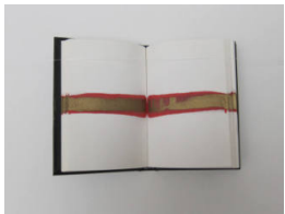
Title: Message Book Date: 1989 Primary Maker: Ruth Tobey Medium: metallic ink on paper in bound book